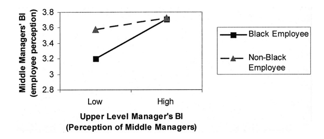
Figure 2. Interaction of employee race and upper level manager behavioral integrity (BI).

This work also contributes to the literature on interactional justice, as it again begins to quantify how different demographic groups of perceivers process justice and injustice cues differently. It extends Davidson and Friedman's (1998) persistent injustice effect and applies it in particular to interpersonal justice. Perceptions of justice and injustice are central to effective diversity management (Huo & Tyler, 2001), and the current study begins to shed light on very relevant demographic differences in the processing of justice and injustice cues. Bies (2005) called for additional research on interactional and interpersonal justice, and the current work responds to that call.